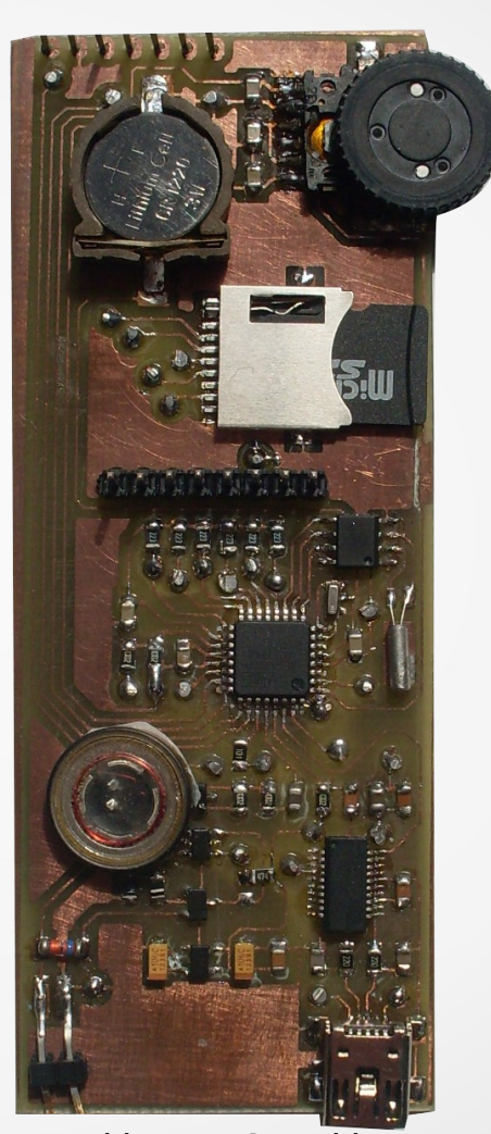
Fig 1 Contactless Attendance Logger – final product and bare PCB with components